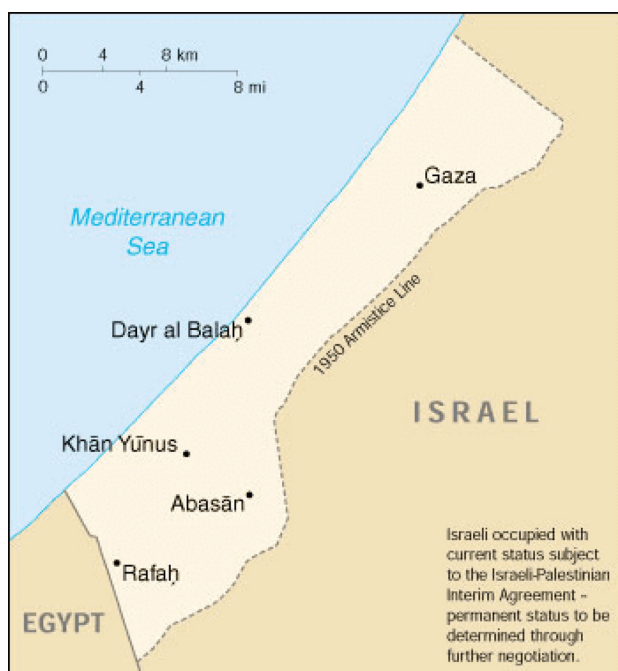
Figure 1: The map of the Gaza Strip.

The location of the Gaza Strip is in the transitional zone between the Sinai Peninsula that have an arid desert climate and the Mediterranean coast of the semi humid climate that affects the average temperature around the year. Whereas it ranges between 12–14 °C in the winter